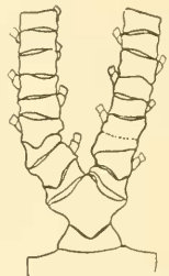
FIG. 4.— HELIOMETRA TANNERI : SHOWING AN ARM WITH THE FIRST TWO BRACHIALS REPEATED.